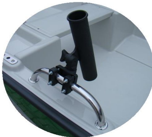
1x fishing rod socket PCV mounted on the railing