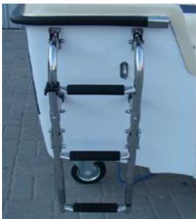
ladder INOX 3-steps spreading