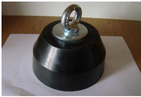
* weight 5kg in a rubber cover net price PLN 120