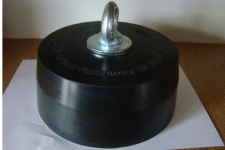
* weight 14 kg in a rubber cover net price PLN 200