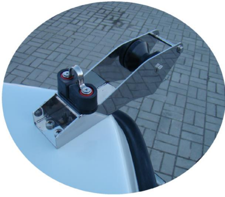
windlass (roll) INOX big with self-clamp and ear INOX