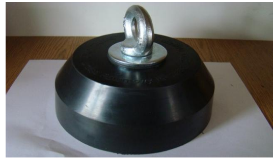
* weight 9 kg in a rubber cover net price PLN 180