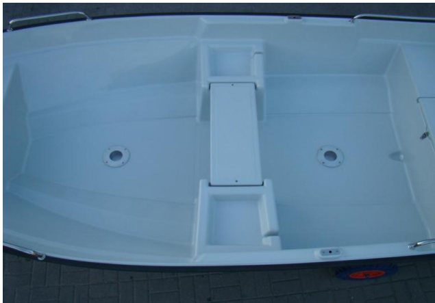
* 2x sockets under the foot of the chair