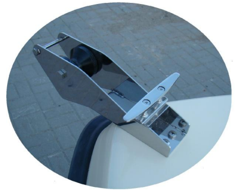
windlass (roll) INOX big with "cornual" cleat INOX