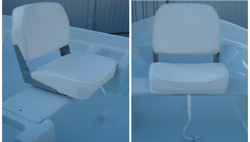
* swivel chair mounted on the middle bench net price PLN 800