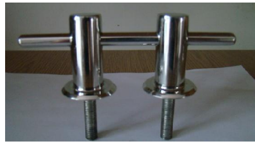
cleat INOX "rod"