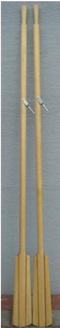
* 2x paddles with rowlocks INOX net price PLN 300 zł