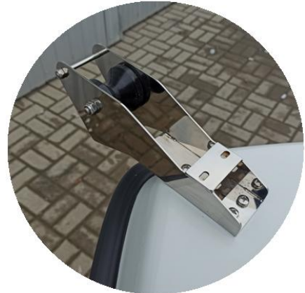
windlass (roll) INOX big