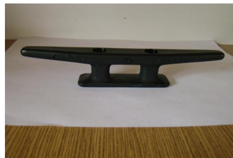
cleat "cornual" PCV