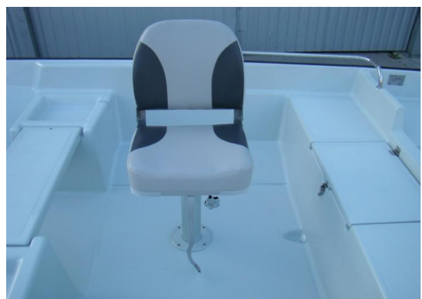
* complete folding swivel chair