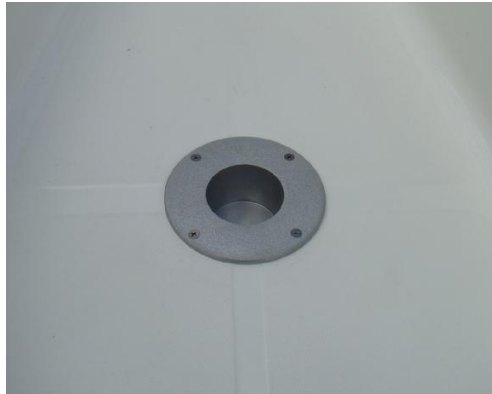
* socket under the foot of the chair