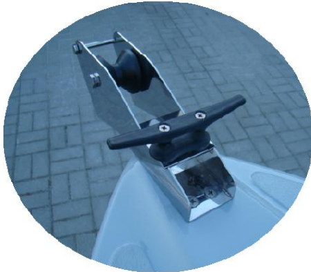
windlass (roll) INOX big with "cornual" cleat PCV