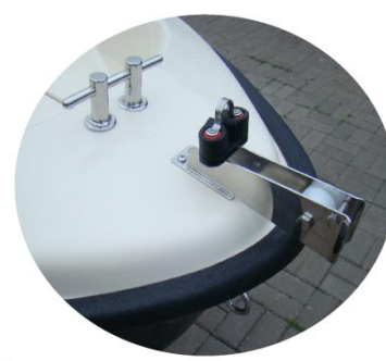
* windlass (roll) INOX smal with self-clamp and ear INOX for weight 5 kg