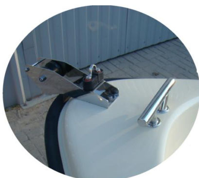
* windlass (roll) INOX big with self-clamp and ear INOX for weight 14 kg

+ cleat "cannular" INOX behind the windlass