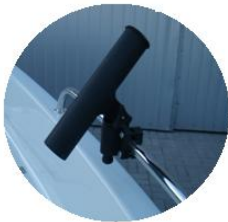
* 2x fishing rod socket INOX with plug