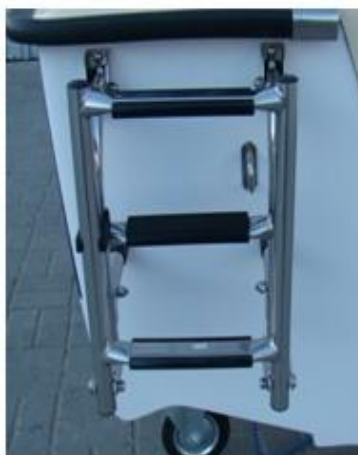
* ladder 3-steps spread INOX, mounted on the left side