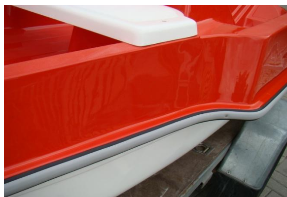
* bumper strip 2-parts + endings INOX