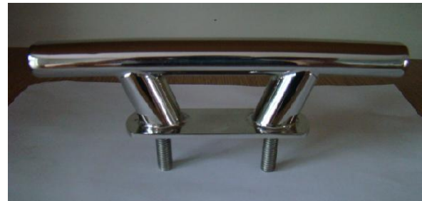
* 2x cleat INOX "cannular"