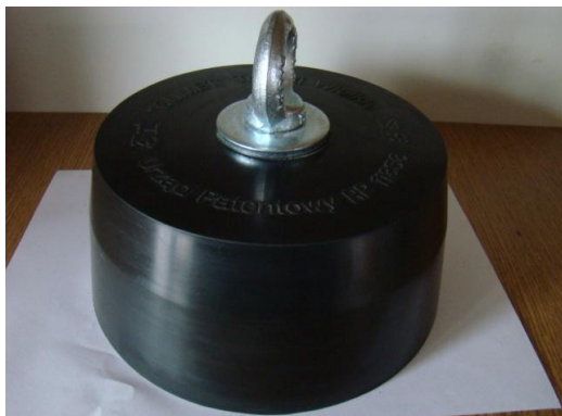
* weight with rubber binding 14 kg