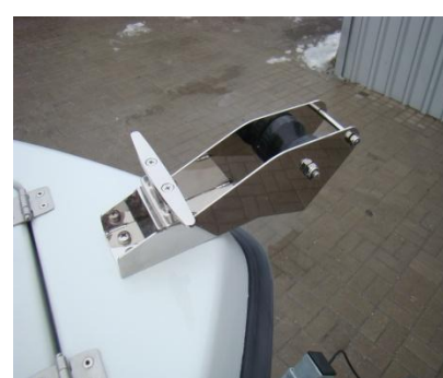
* windlass (roll) INOX big with cornual cleat INOX for weight 14 kg