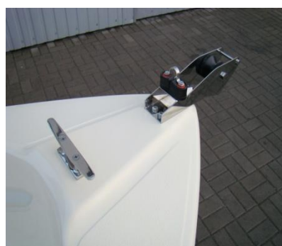
* windlass (roll) INOX big with self-clamp and ear INOX for weight 14 kg

+ cleat "cannular" INOX behind the windlass