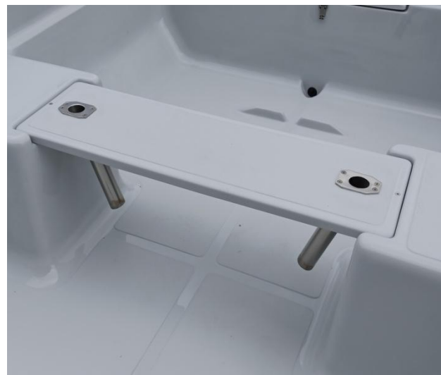
* 2x fishing rod socket INOX available only fishing rod sockets with a plug