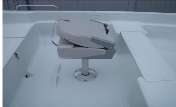
* folding swivel chair