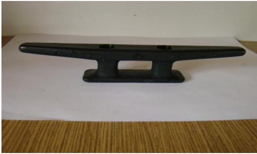
* 2x cleats PCV black