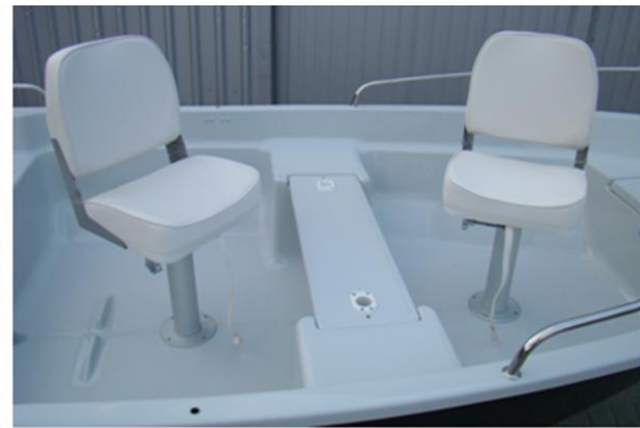
* 2x folding swivel chairs