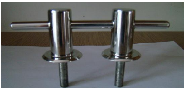
* 2x cleat INOX "rod"