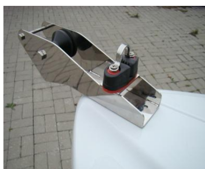
* windlass (roll) INOX big with self-clamp and ear INOX for weight 14 kg