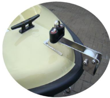
* windlass (roll) INOX smal with self-clamp and ear INOX for weight 5 kg