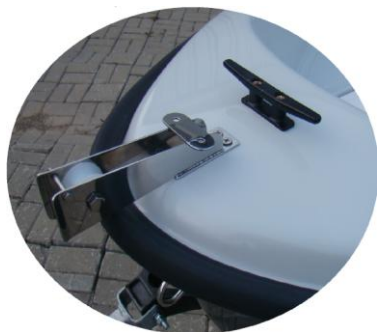
* windlass (roll) INOX smal for weight 5 kg