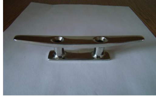
* 2x cleats INOX "cornual"