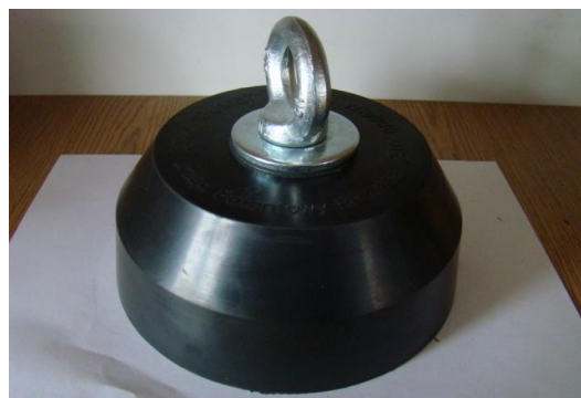
* weight with rubber binding 9 kg