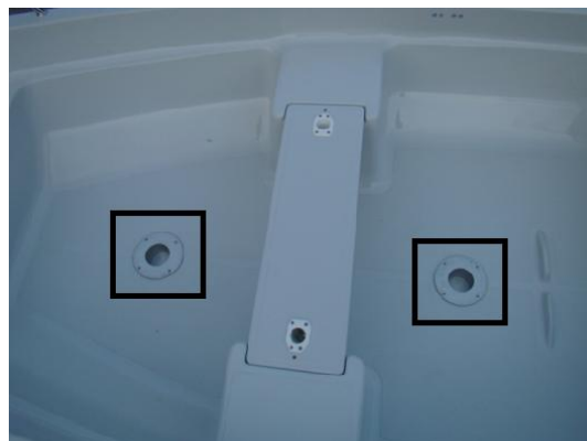
socket for the leg of the chair + reinforcement in the floor, montage and sealing