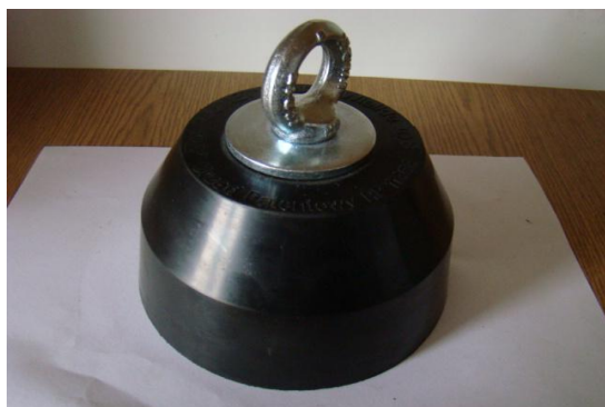
* weight with rubber binding 5 kg