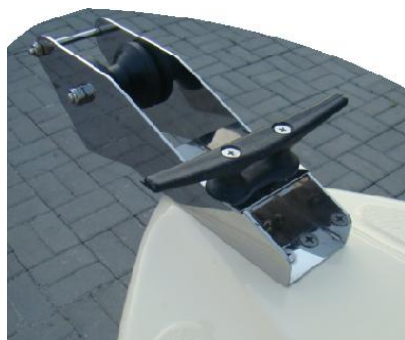
* windlass (roll) INOX big with cornual cleat PCV for weight 14 kg