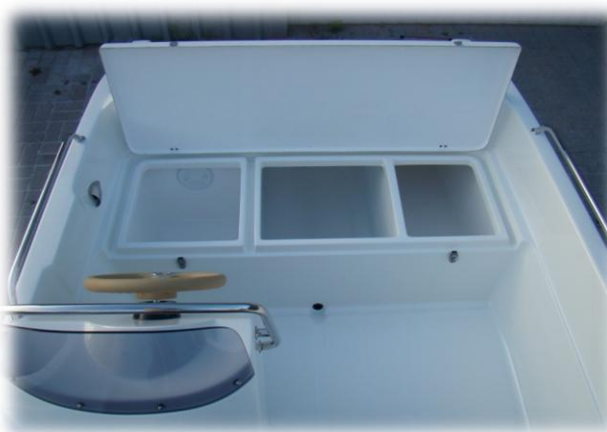
3 lockers at the back of the boat under big bench + holta hatch in the right back locker