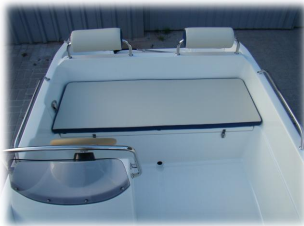
matress for a big bench and back rests with pillows