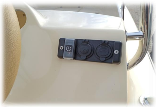
light switch, lighter socket 12V and USB socket