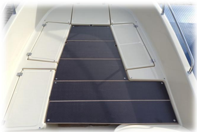
5-pieces sun deck (console to the back)