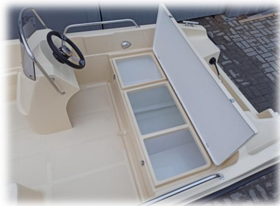
3 lockers in the back of the boat