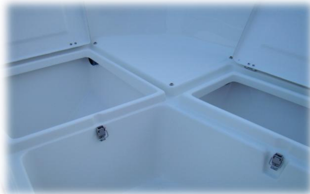
system of channels to put fuel line or electric wires between lockers