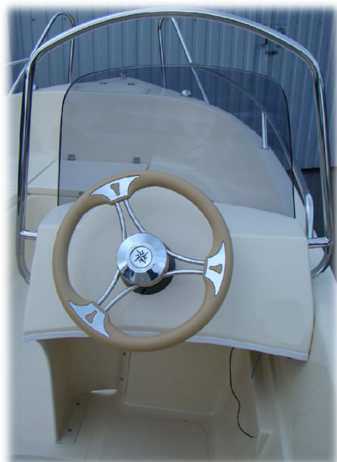
railing INOX and plexiglass on the console HIGHER