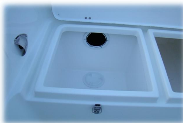
holta hatch in helmsman locker