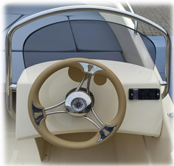
console with cream steering wheel INOX