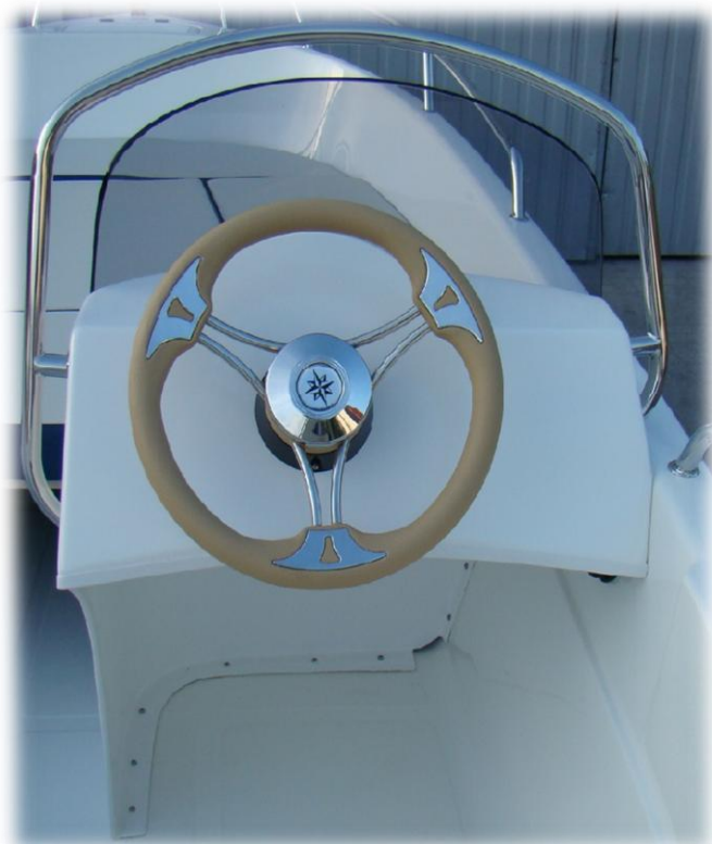
railing INOX and plexiglass on the console standard