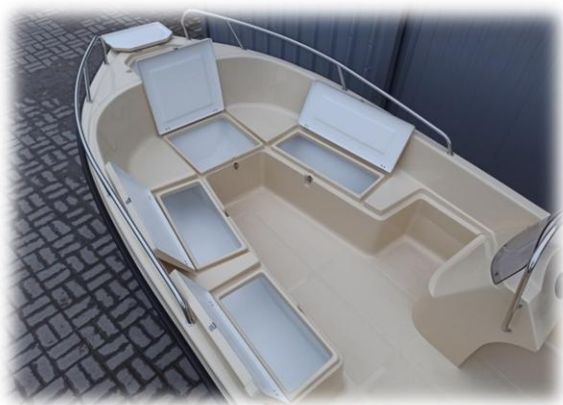
4 lockers in the front of the boat including one 180 cm long