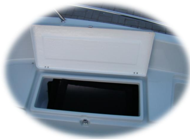
sun deck fits in the right middle locker