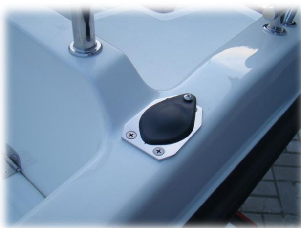
fishing rod socket INOX closed with plug