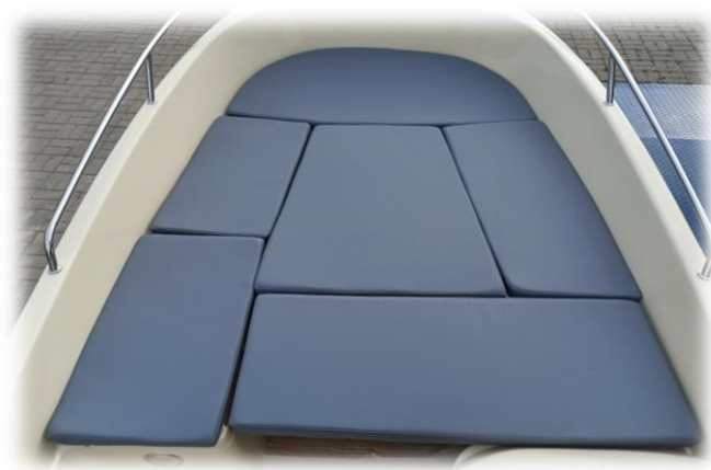
mattresses for U-seats and mattresses for sun deck