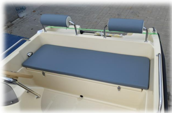
mattress for a big bench and pillows for back rests