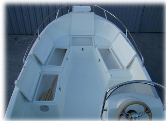
5 lockers at the front of the boat including one 180 cm long for a pagay