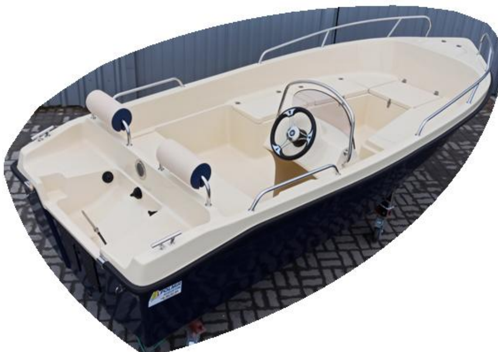
version of the boat with black steering wheel INOX additional payment 100 PLN net