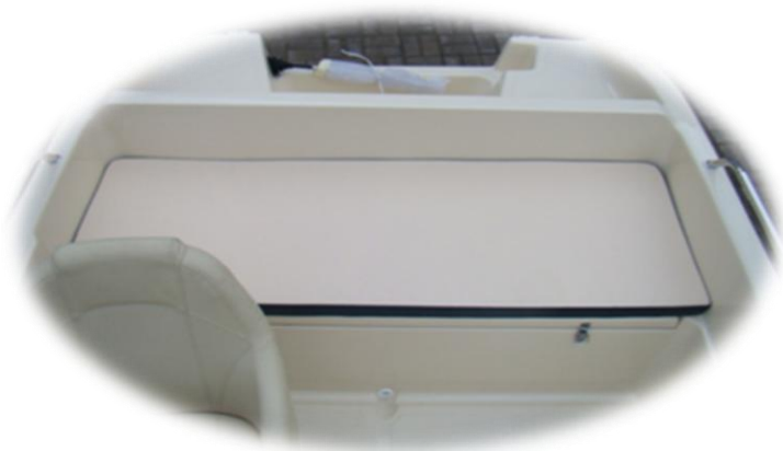
mattresses large flap at the back