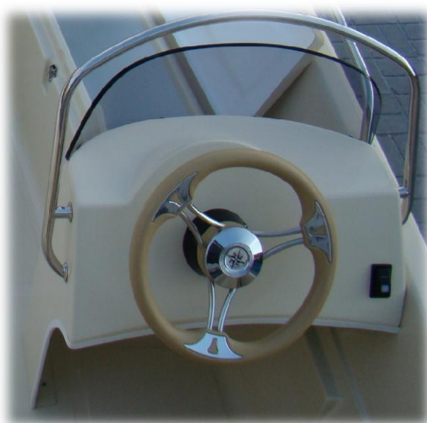
console with cream steering wheel + lights switch