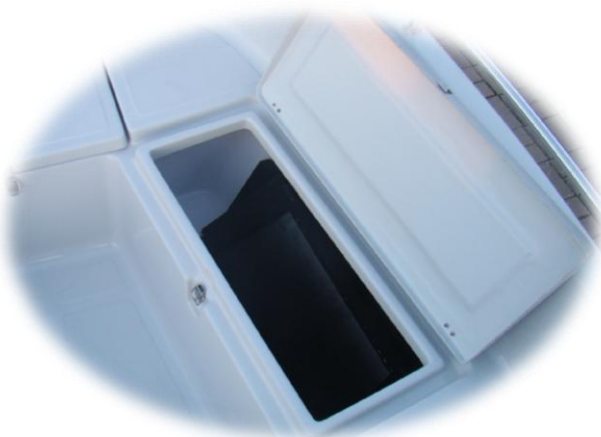
the sun deck fits in the right middle locker