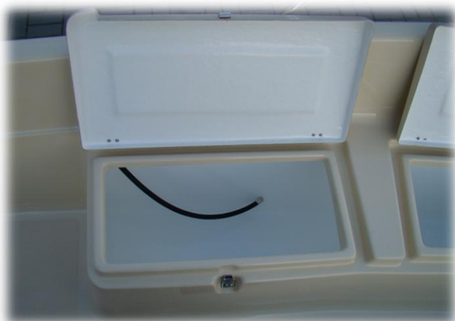
fuel line in the left middle locker