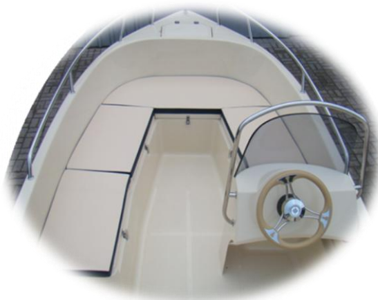
mattresses for U-seats front