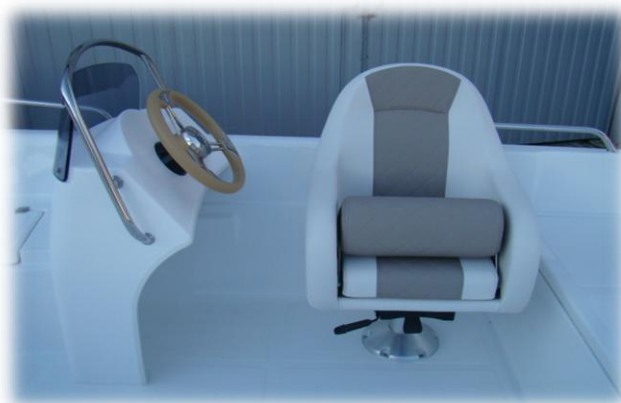
helmsman swivel chair on the crane