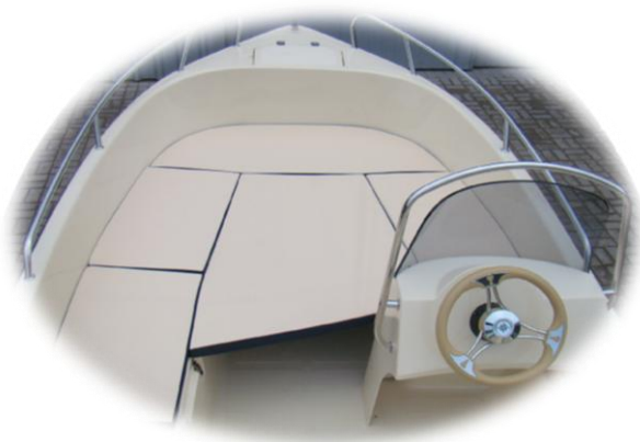
mattresses for U-seats front + mattress for sun deck