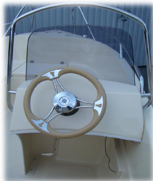
HIGHER plexiglass HIGHER railing INOX on the console