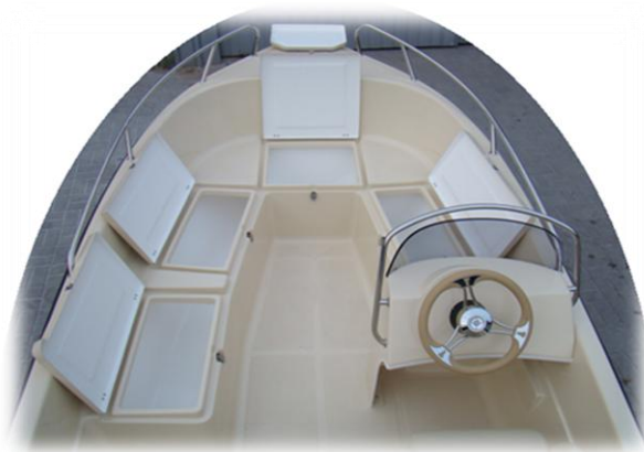
4 lockers at the front including one 180 cm long