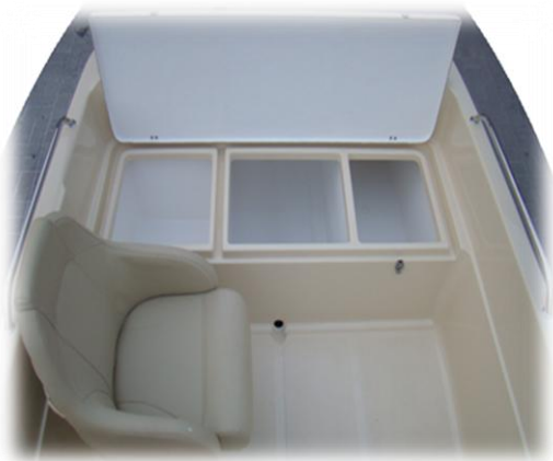
3 lockers at the back under a large flap