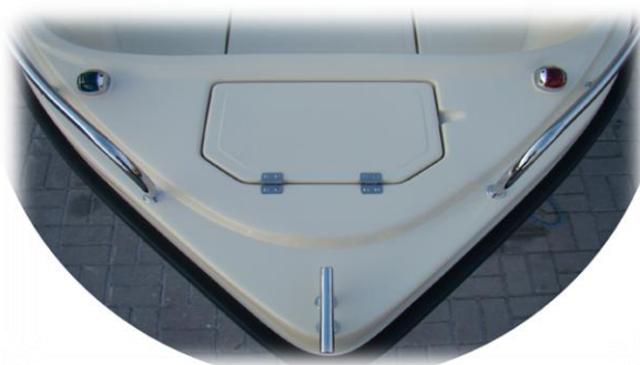
left and right navigation lamp