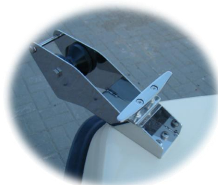
* windlass (roll) INOX forebody/big with cornual cleat