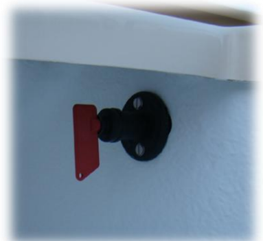
main power switch