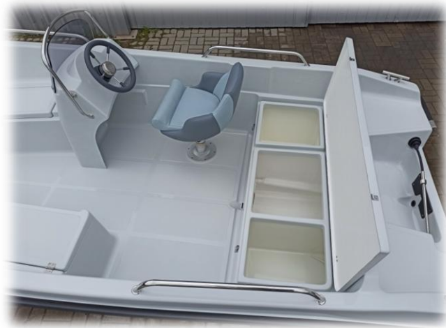
3 lockers at the back under a large flap