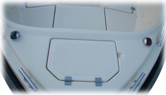
left lamp INOX + right lamp INOX