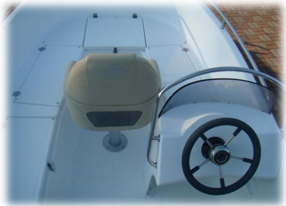
chair foot socket + chair foot and passanger swivel chair