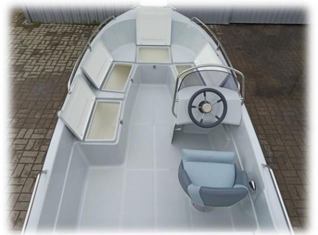
4 lockers at the front including one 180 cm long