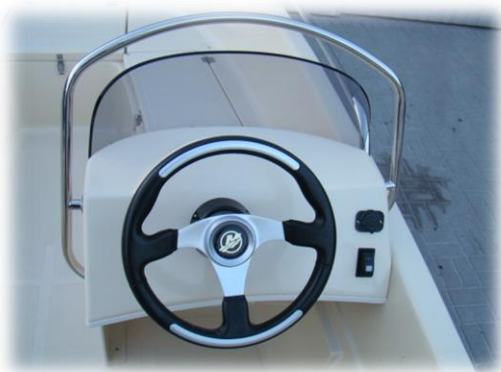
black steering wheel INOX