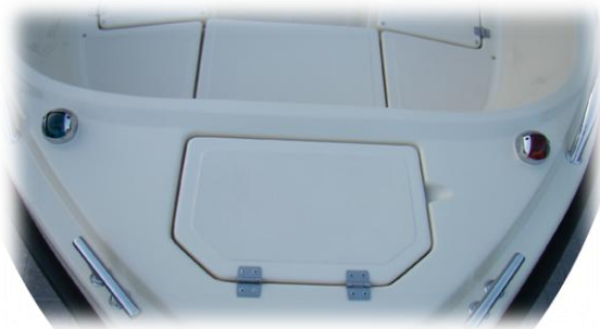
left lamp INOX + right lamp INOX