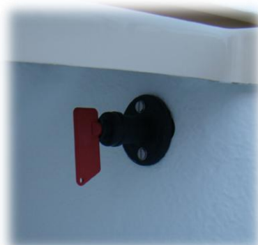
main power switch