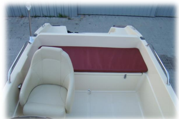
U-seats mattresses front and mattress for a big bench at the back color: claret