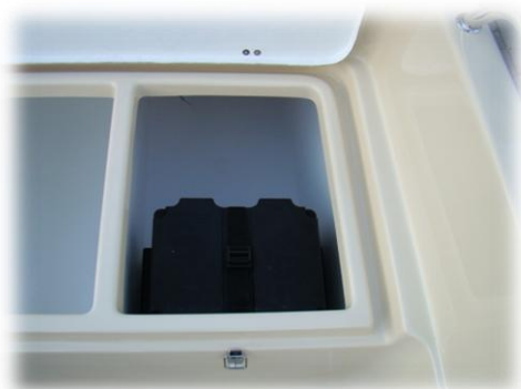
battery box (on the left back locker)