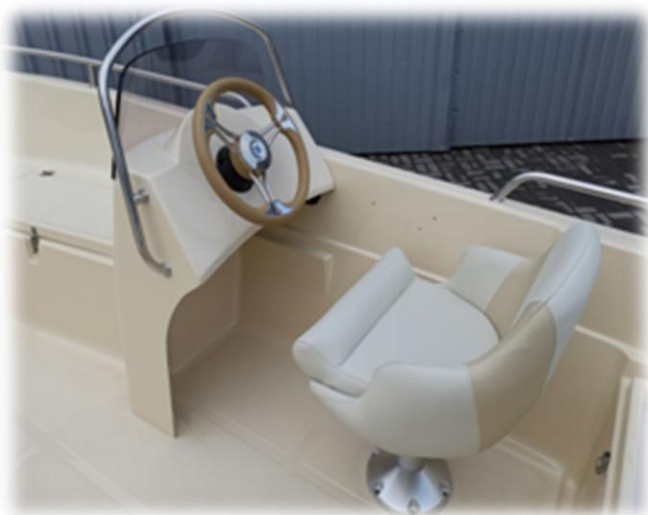
swivel helmsman's chair, beige color with a cream insert and cream INOX steering wheel

net price 26 700 PLN gross price 32 841 PLN