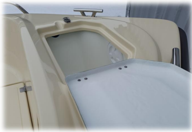
preparation of the bow for mounting electric engine (reinforcement of the bow, holt hatch, channels for wires)