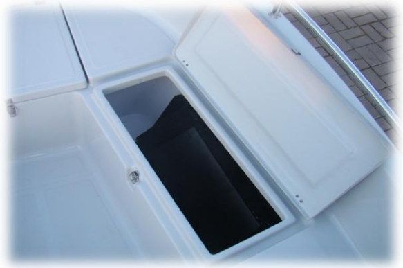
the sun deck fits in the right middle locker