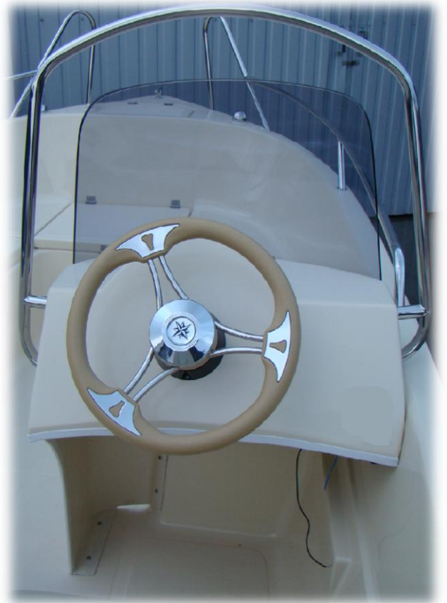
railing INOX and plexiglass on the console HIGHER