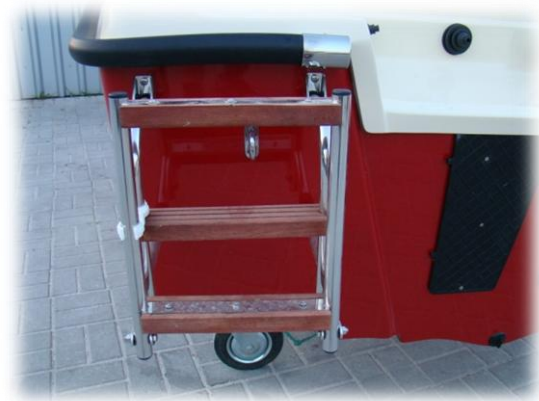
* ladder INOX folding 3-step with reinforcement and assembly on the left side