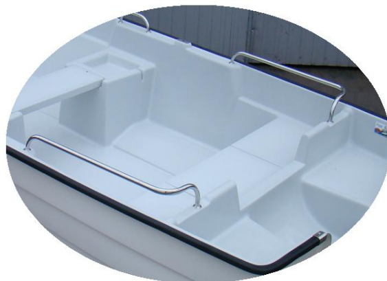
* 2x railing INOX in the back (bent in the shape of a letter L)