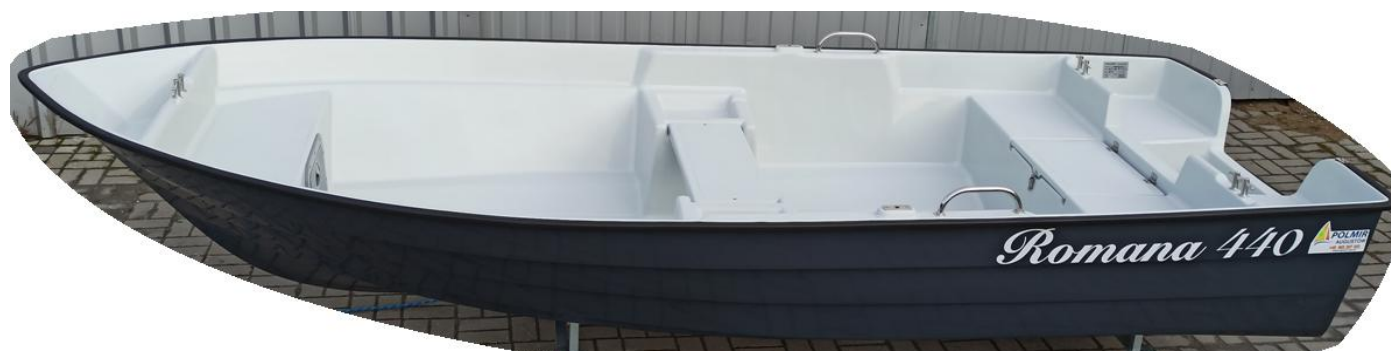
* locker in the front, under front seat