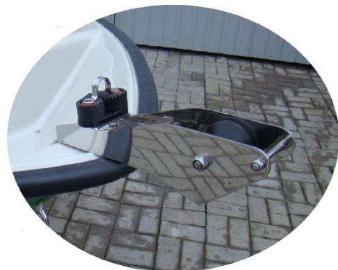
* windlass (roll) INOX forebody/big with self-clamp and ear INOX