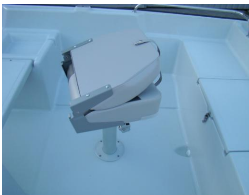
Complete swivel chair