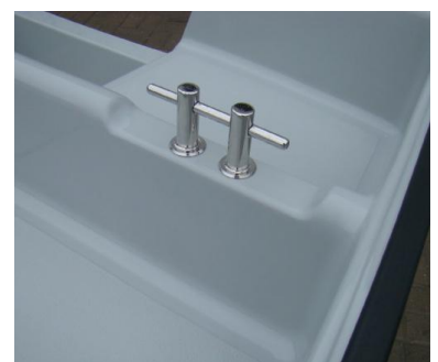
* 2x cleat INOX "rod" in the back