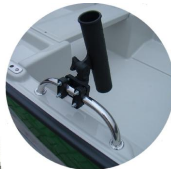
* 2x fishing rod sockets PCV mounted on the railing