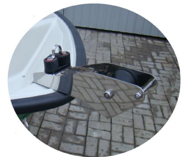
* windlass (roll) INOX forebody/big with self-clamp and ear INOX