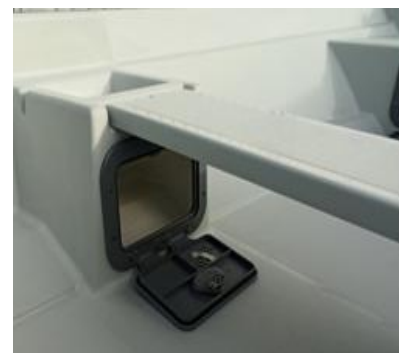
* locker in the left side near the middle bench