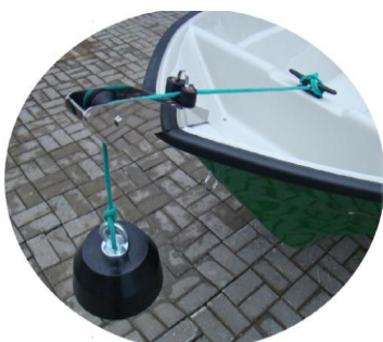
* windlass (roll) INOX forebody/big with self-clamp and ear INOX