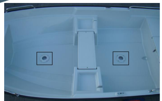
2x sockets for the foot of the chair