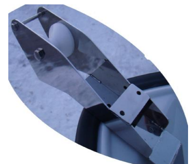
* windlass (roll) INOX forebody/big