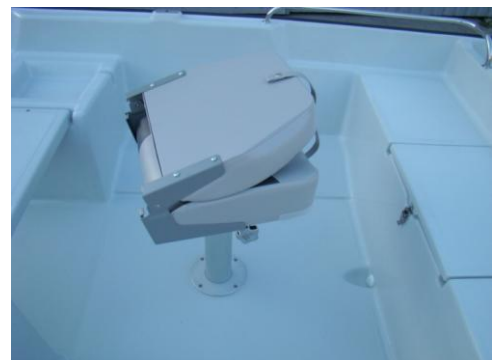
* swivel chair