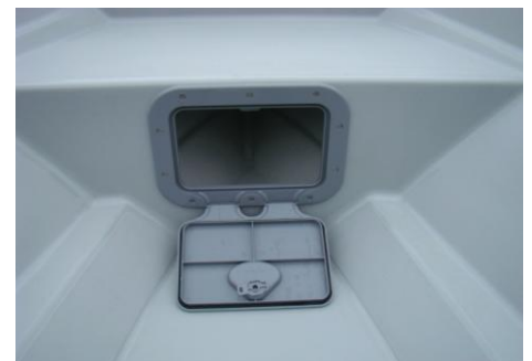
* locker in the front, under front seat