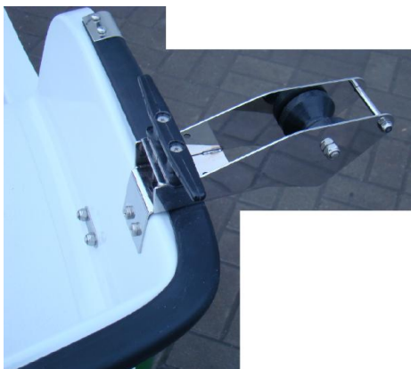
* windlass (roll) INOX forebody/big with "cornual" cleat