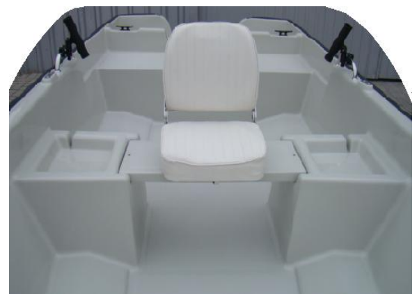
* swivel chair mounted on the middle bench