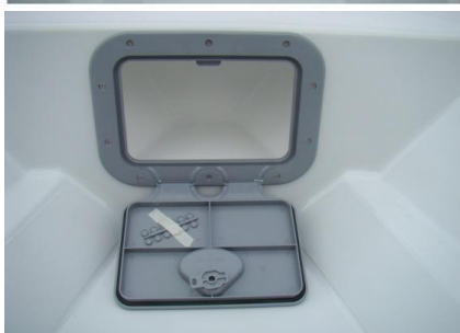
* locker in the front, under front seat