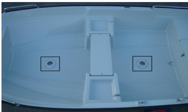
* socket under the leg of the chair Fi 80