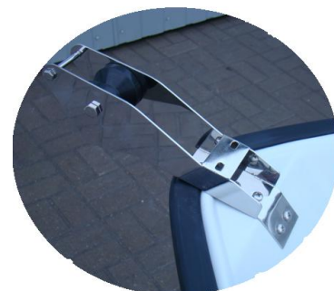
* windlass (roll) INOX forebody/big