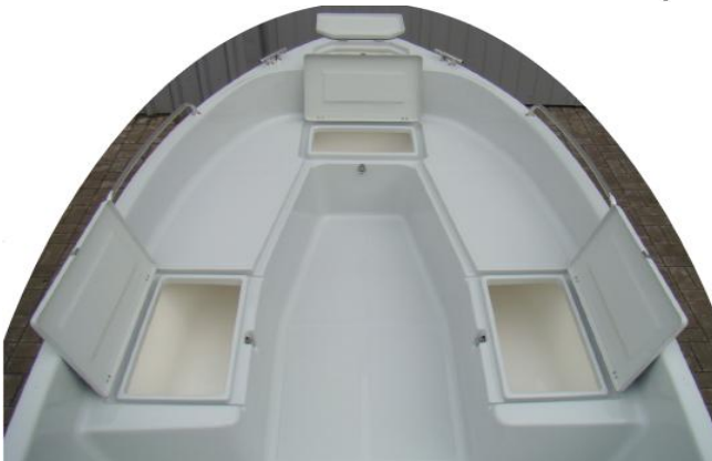
4 lockers at the front of the boat including two (one in the left and one in the right) 130 cm long each