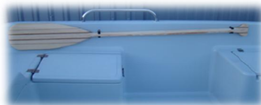
* pagay with lug piece