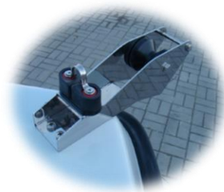
* windlass (roll) INOX forebody/big with self-clamp and ear INOX