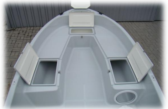
* additional door in the right locker