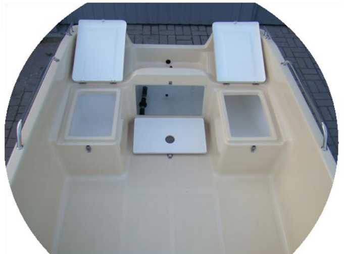
3 lockers at the back of the boat