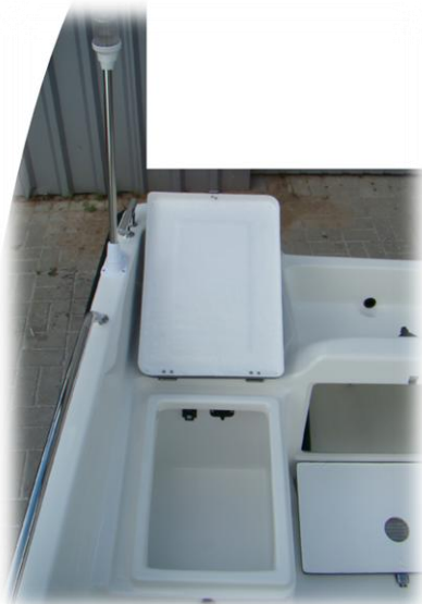
navigation lights switch + lighter socket 12V