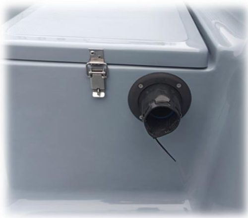
exit to the sonar and channels for carrying wires