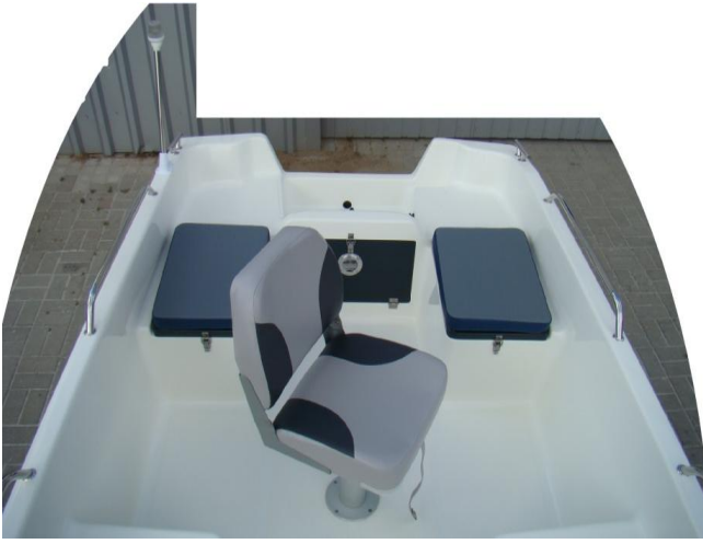
complete swivel chair at the back