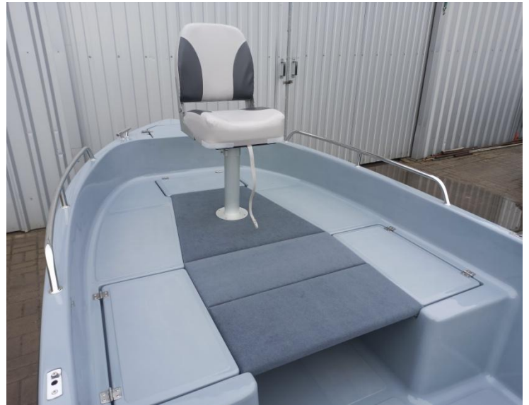
fishing deck with swivel chair