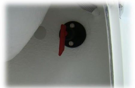
* power switch