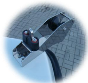
* winda kotwiczna (rolka) INOX dziobowa/duża z samozaciskiem i uchem INOX