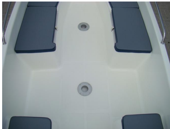
* socket for leg fi 80 of the swivel chair