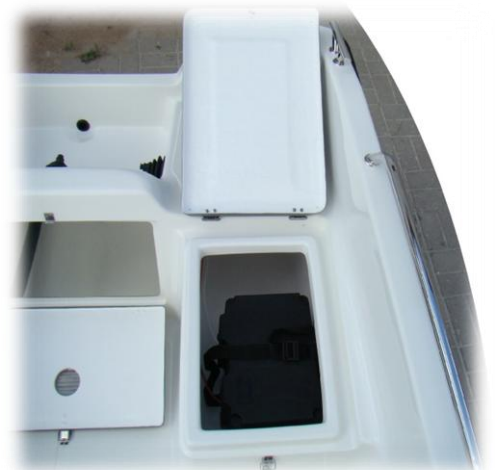
* battery box

net price 23 400 PLN gross price 28 782 PLN