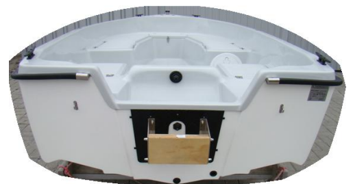
pantograph INOX for mounting the motor with S foot