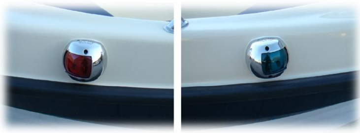
left and right navigation lamp INOX