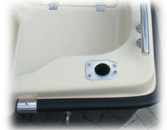
* 2x fishing rod sockets INOX closed with plug