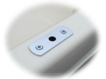
* 2x rowlocks sockets with montage and reinforcement of boat