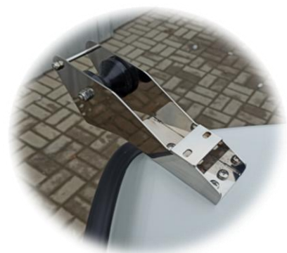
* windlass (roll) INOX forebody/big