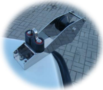
* windlass (roll) INOX forebody/big with self-clamp and ear INOX