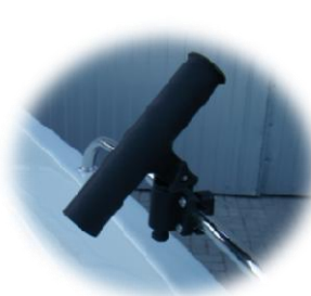
* 2x fishing rod socket PCV mounted on the railing