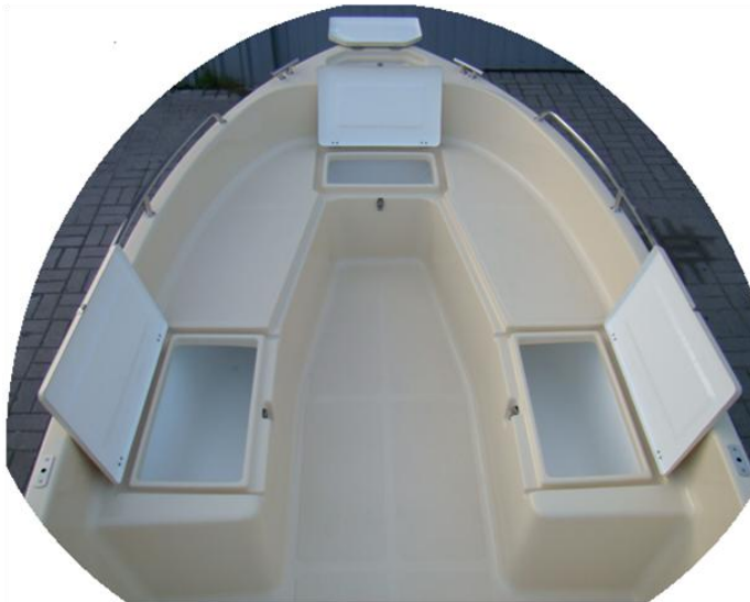
4 lockers at the front of the boat including two, 130 cm long each