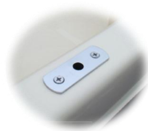
* 2x rowlocks sockets with montage and reinforcement of boat