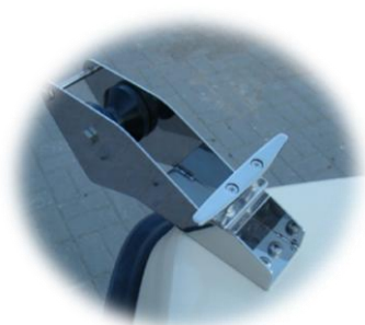
* windlass (roll) INOX forebody/big with cornual cleat INOX