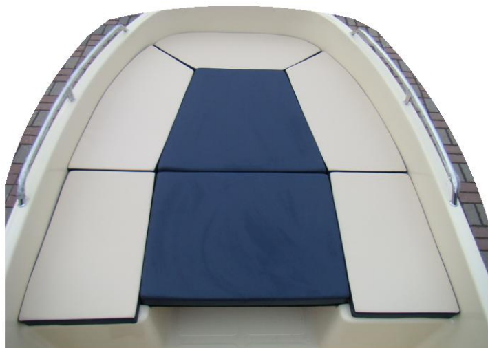
matresses for U-seats front (cream with navy blue sides) and mattresses for sun deck (navy blue)