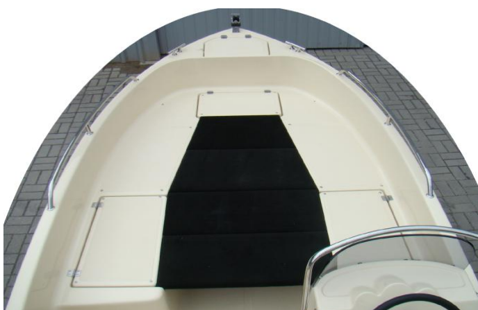
* sun deck / fish deck 4 pieces with waterproof plywood padded with felt