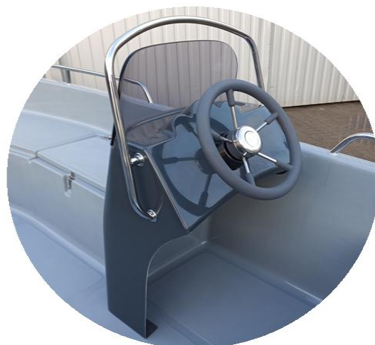
a console with a gray steering wheel, which stands out from the deck