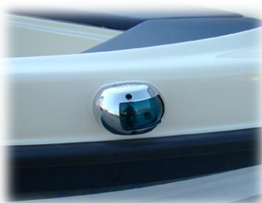
right and left lamp INOX