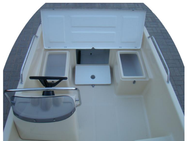
3 lockers at the back of the boat and big flap