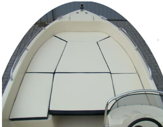
matresses for U-seats (5 parts) (cream with navy blue sides) and for the sun deck (2 parts) (cream with navy blue sides)