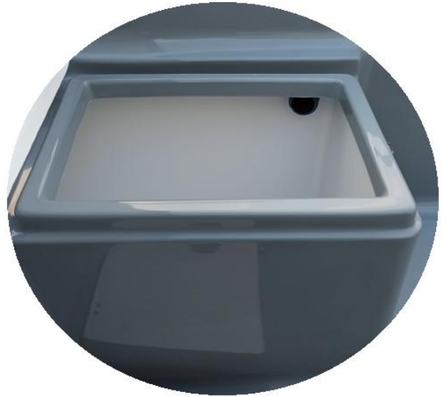
channel in the locker for carring the wires