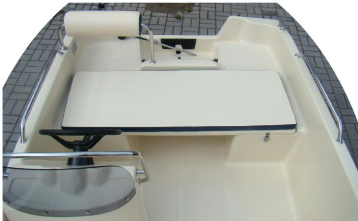
mattress for the big bench and pillow on the back rest (cream with navy blue sides)