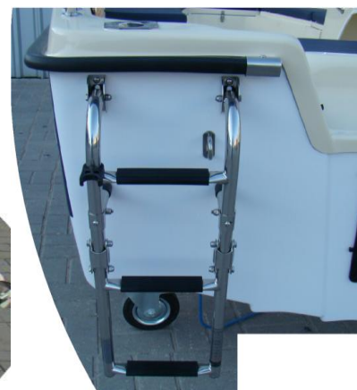
* ladder 3-steps drop-down INOX with reinforcement and montage