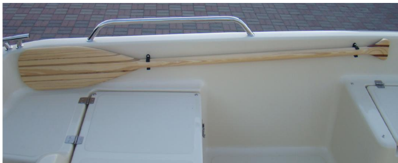
* pagay with lug piece