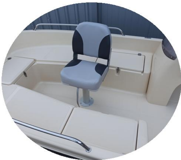
removable swivel chair