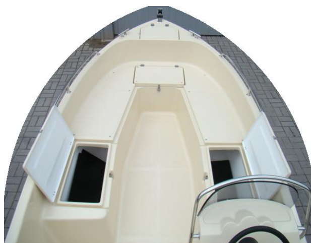
sun deck elements fits into side lockers