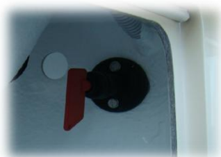
main power switch