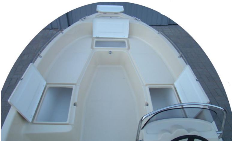
4 lockers at the front of the boat