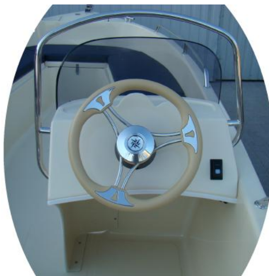
steering wheel + lights switch