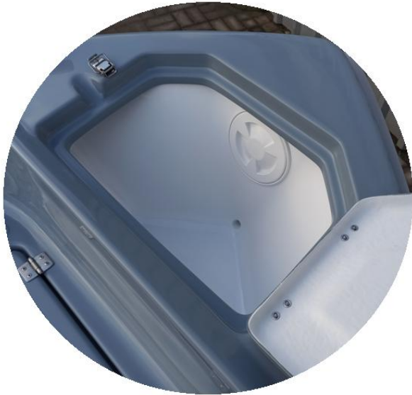
holt hatch for mounting electric motor on the bow