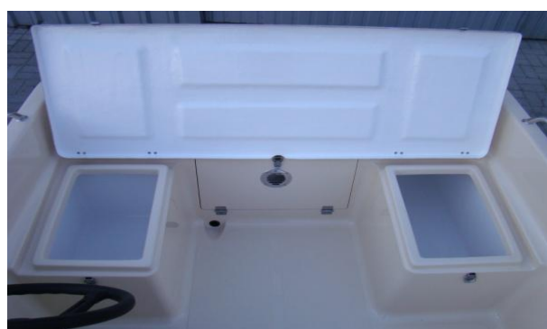
3 lockers at the back of the boat