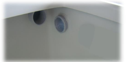
a channels to carrying the wires