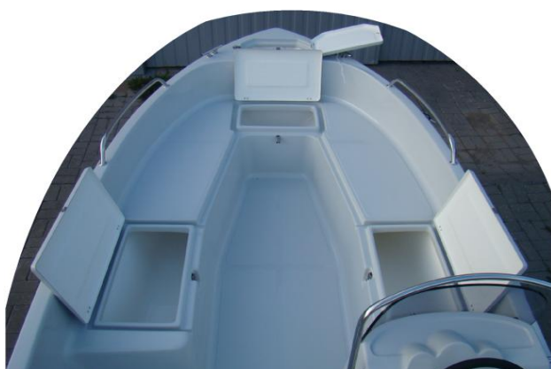
4 lockers at the front of the boat