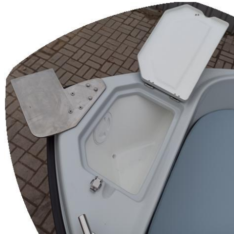
stand for the electric motor on the bow