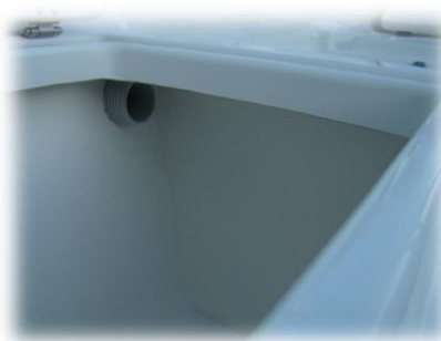
a channels for carrying the wires