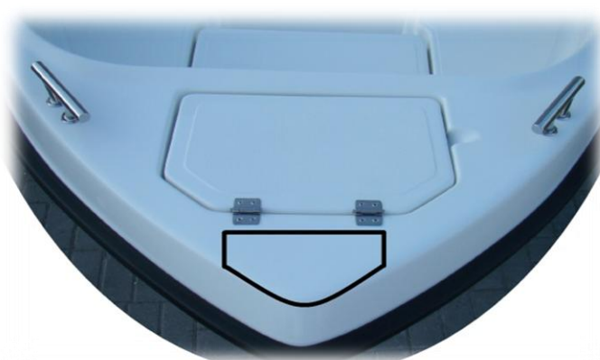
bow reinforcement for electric motor