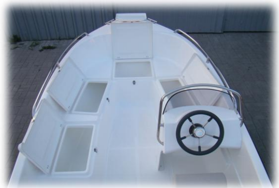
four lockers at the front of the boat including one 180 cm long