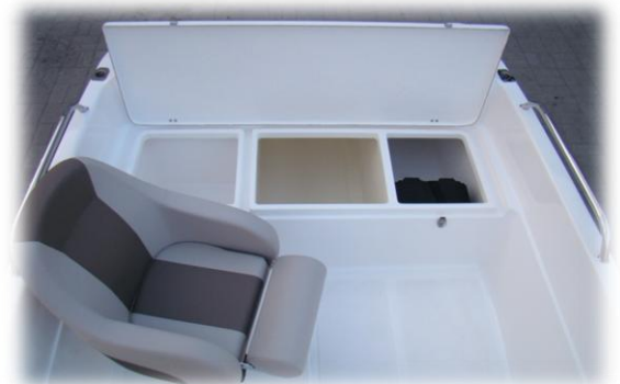
three lockers at the back of the boat