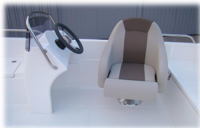
helmsman chair on the crane