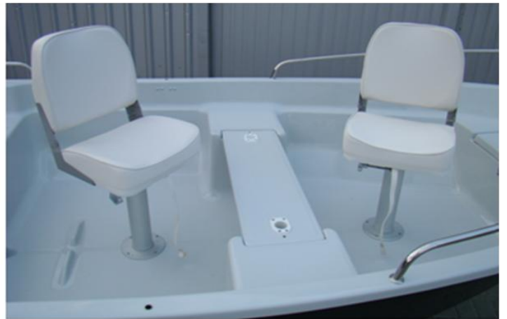
folding swivel chairs