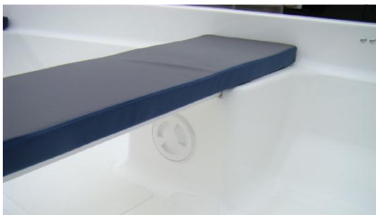
additional locker under middle bench