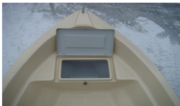
locker at the back of the boat