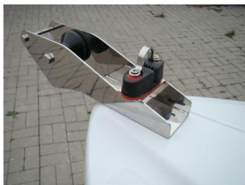
* windlass (roll) INOX big with self-clamp and ear INOX for weight 14 kg