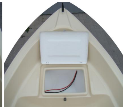
* channel to put wires from engine to the back locker