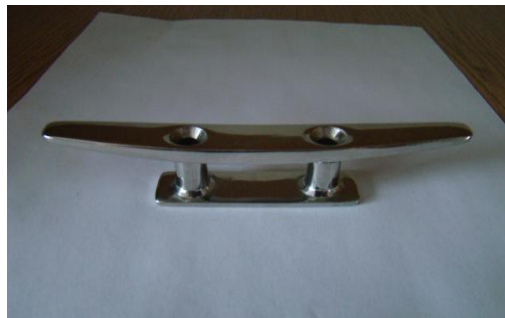
* 2x cleats INOX "cornual"