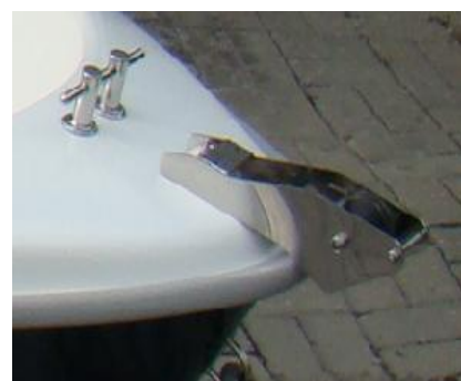
* windlass (roll) INOX big for weight 14 kg

+ cleat "cornual" INOX behind the windlass